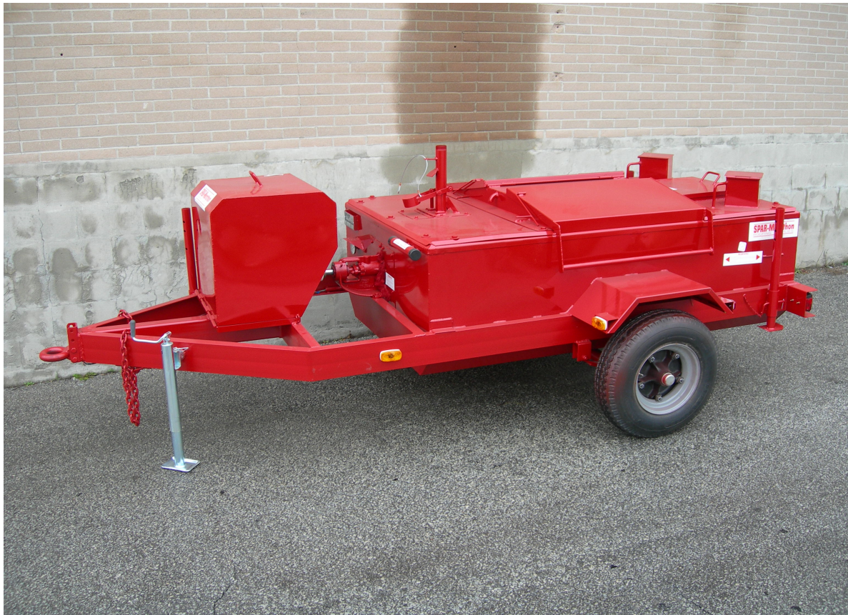
Dual Lid Standard (Single Lid Optional)

88 Signet Drive Weston, ON M9L 1T3 Tel: (416) 744-2050 Fax: (416) 744-4247